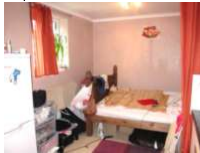
Extension room, with ensuite shower room/wc