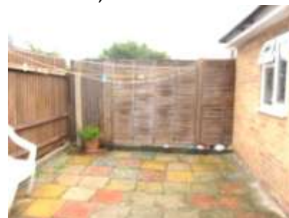
Rear patio garden