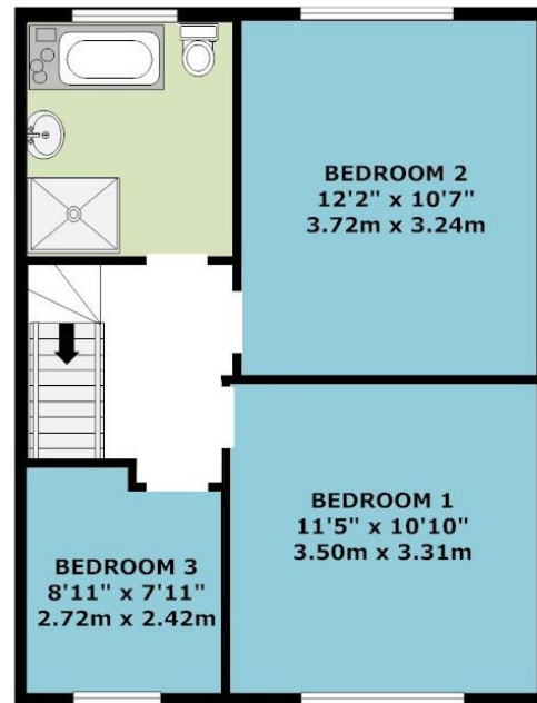
GROUND FLOOR FIRST FLOOR APPROX. GROSS INTERNAL FLOOR AREA 1076.39 SQ F / 100 SQ M

These particulars are issued on the understanding that all negotiations are conducted through Phillips & Co. Whilst every care has been exercised in the preparation of particulars their accuracy is not guaranteed neither do they constitute an offer nor contract.