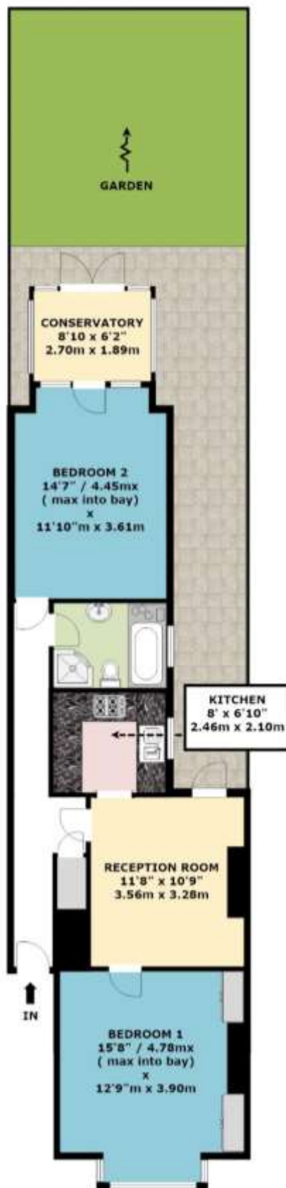
GROUND FLOOR FLAT

APPROX. GROSS INTERNAL FLOOR AREA 701.00 SQ F / 65.11 SQ M